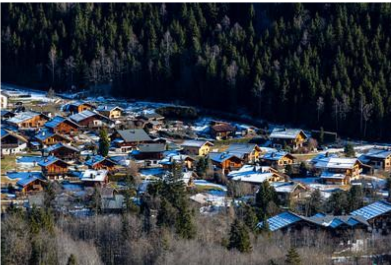
Les Contamines Montjoie