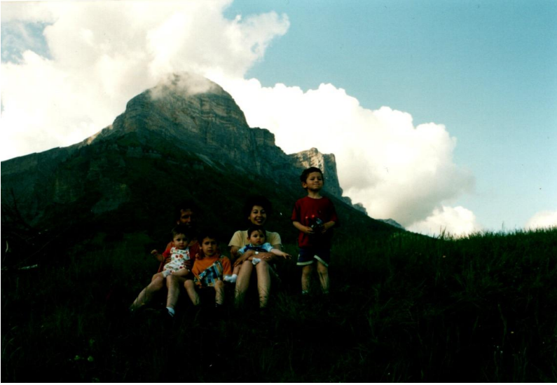
La Dent de Crolles vue de Saint Pancrasse. Paradise on earth as Sami used to say.